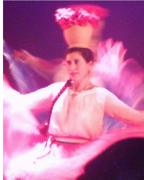
Paraguayan Dancer at the Stamford harp Festival Lincolnshire 2003

Keith has recently changed the colour of the website to a desert beige and has created a photo archive and is full of ideas.