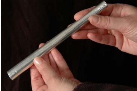
PURE SILVER COVERED TUNING LEVER

Language was not a problem there in family Saad: Polish, French, English Russian and Aramaic tongues bounce across the table at mealtimes!