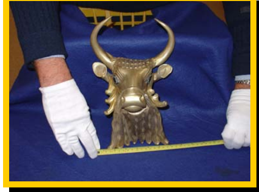
BULLS HEAD at the British Museum