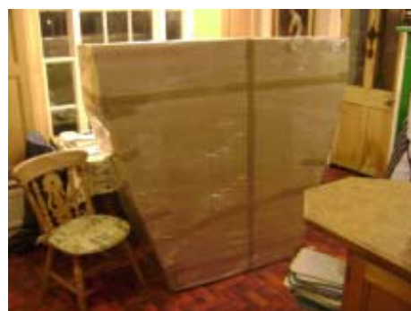
Lyre packed ready for trip to USA

This is a very modern, state-of-the-art performance venue, with excellent sound and lighting facilities. It seats around 330 people, and on Saturday 14 March there was a full house.