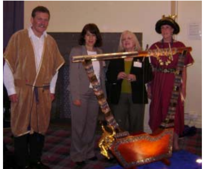
With the Organisers

poetry. Many of course were familiar with the story of this iconic instrument from the Middle East, and were delighted to see that a playable replica had been made, and to hear what it sounded like.