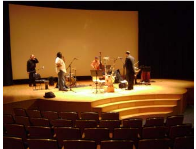
Rasmuson Theatre stage, Smithsonian Institute, Washington DC