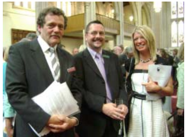
The Award Ceremony

It was completed by an awards ceremony in the Guildhall London with Lady Churchill present.