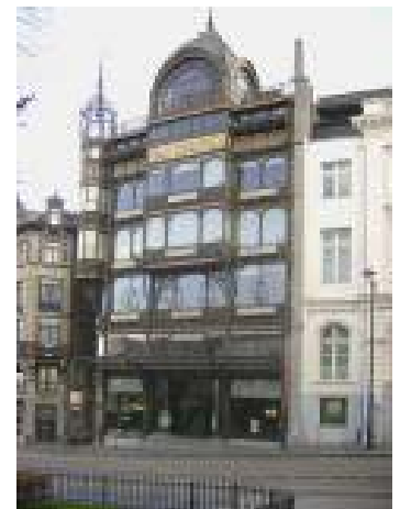
Musical Instrument Museum