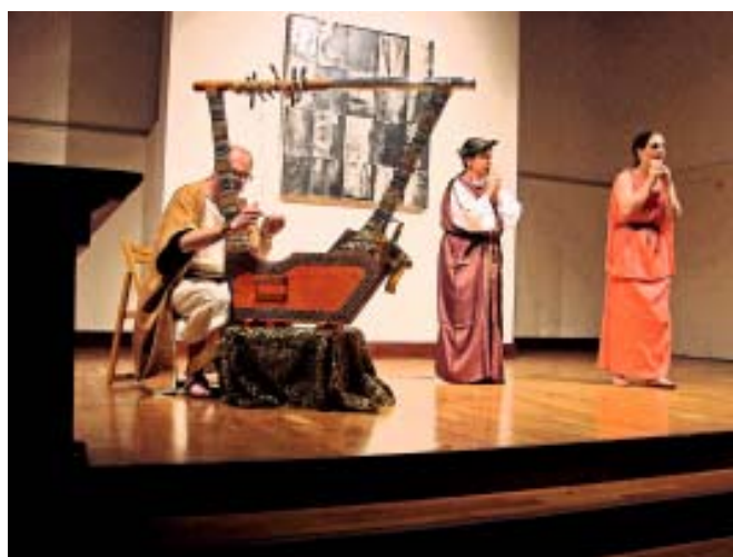
Bolivar Hall, London