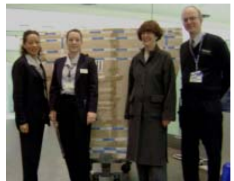
United Airline Staff at Heathrow

The latter was read by a lady, well-known in Iraq as a newsreader on Iraqi television.